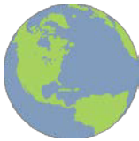
Language Interpreters Telephones