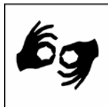
American Sign Language Translator Services